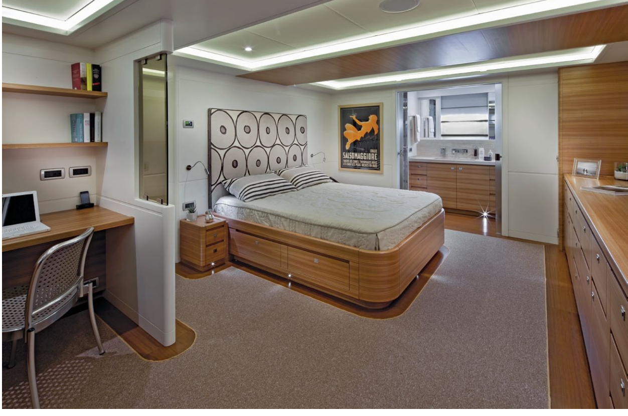
RIGHT: The full-beam master stateroom is made not only for comfort and luxury, but livability BELOW: All the cabins were designed with long family cruises in mind