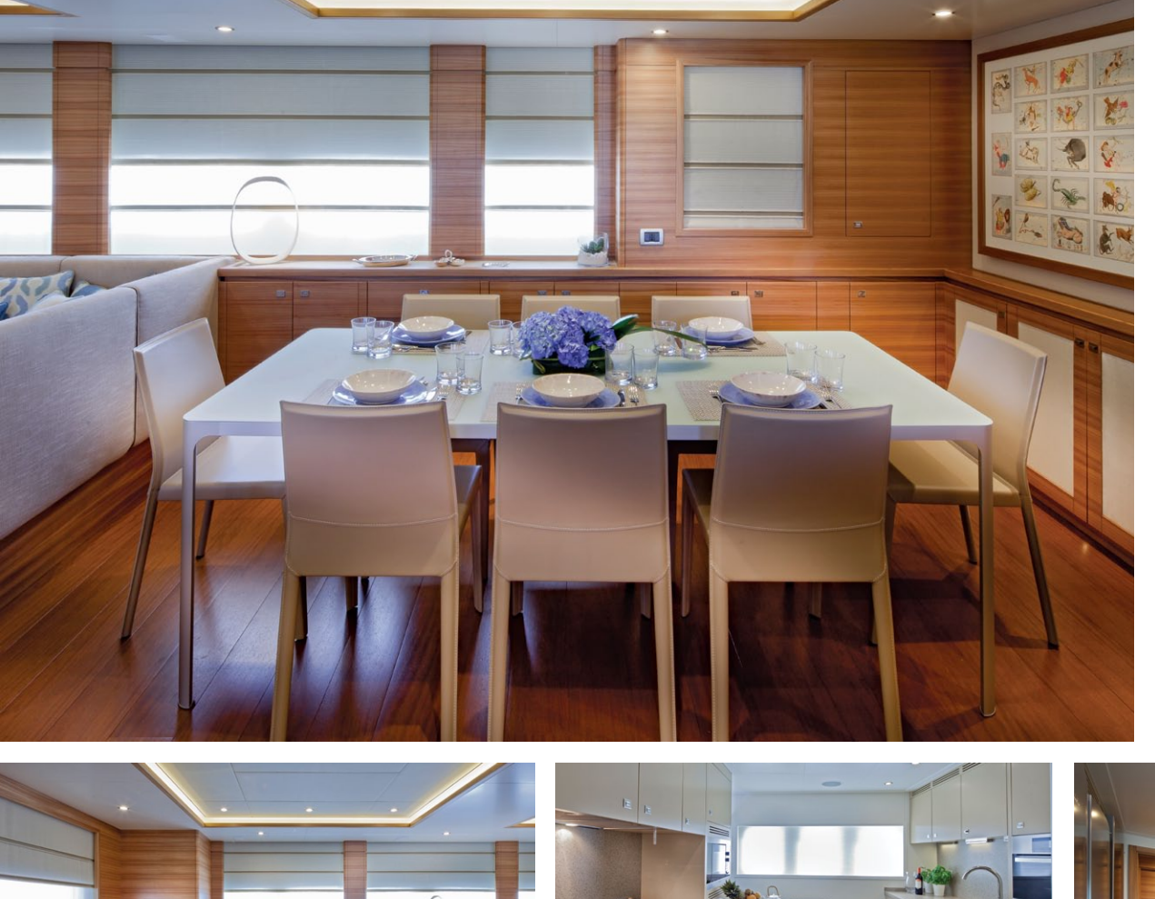
LEFT: The dining room, adjacent to the main salon, easily accommodates a comfortable family meal BELOW: The spacious crew mess enjoys primo real estate, across the galley