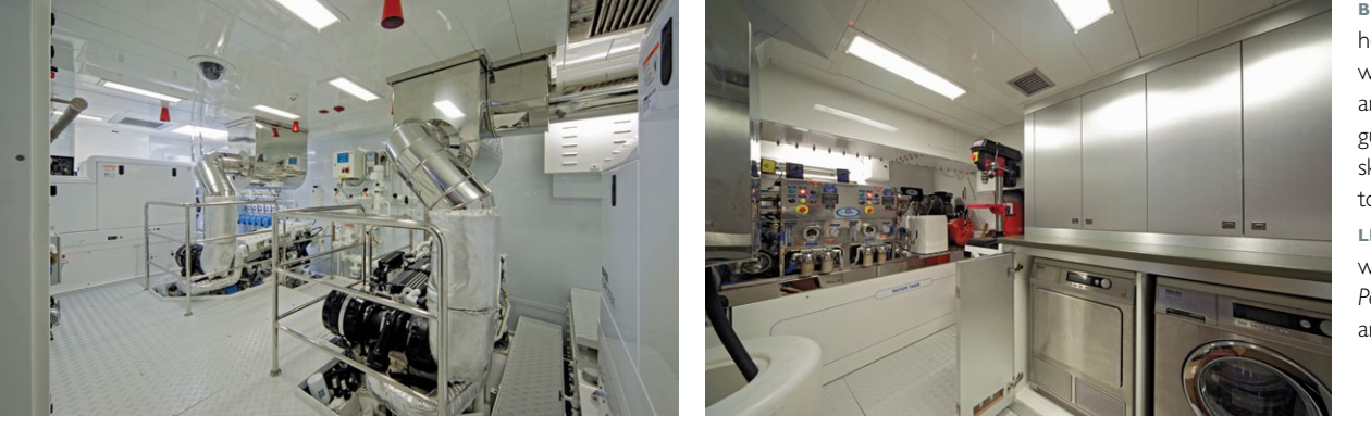
BELOW: The upper deck houses the wheelhouse with its expansive views and extra seating for guests as well as the skylounge, a perfect place to relax while cruising LEFT: The technical and working areas onboard Percheron are above par and worth seeing

Few of the owner's guests will get to see the engine room, but