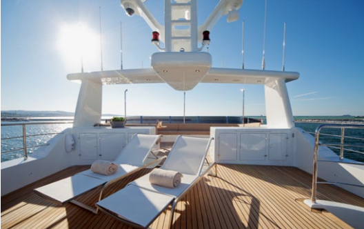
During her planned circumnavigation, Percheron will face all kinds of seas and weather conditions, but her sturdy hull and spacious interior and exterior areas mean she's equipped to handle it all