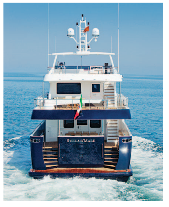
SPECIFICATIONS: LOA: 98'8" BEAM: 24'3" DRAFT: 7'6" DISPL.: 430,000 lb. FUEL: 8,800 gal. WATER: 880 gal. ENGINES: 2 x 965 bhp MTU 8V 2000 M72 diesels BASE PRICE: $8,820,000

The yacht was designed for multigenerational family use, which explains the massive VIP suite for the owner's parents. It is almost as large as the master stateroom. At one of Stella di Mare's five port stops last summer, 22 people were on board, 11 of them children. Deck space is also one of the Darwin 96's strong suits. There were a